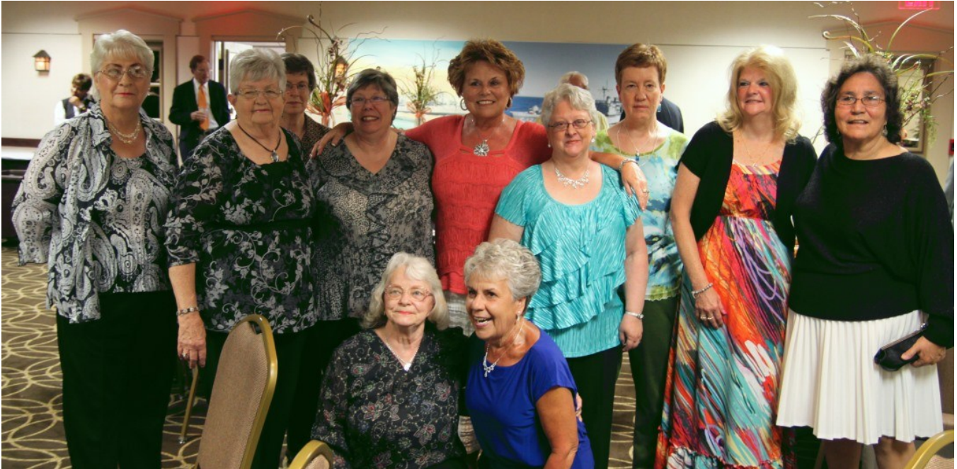
Some belles of the ball