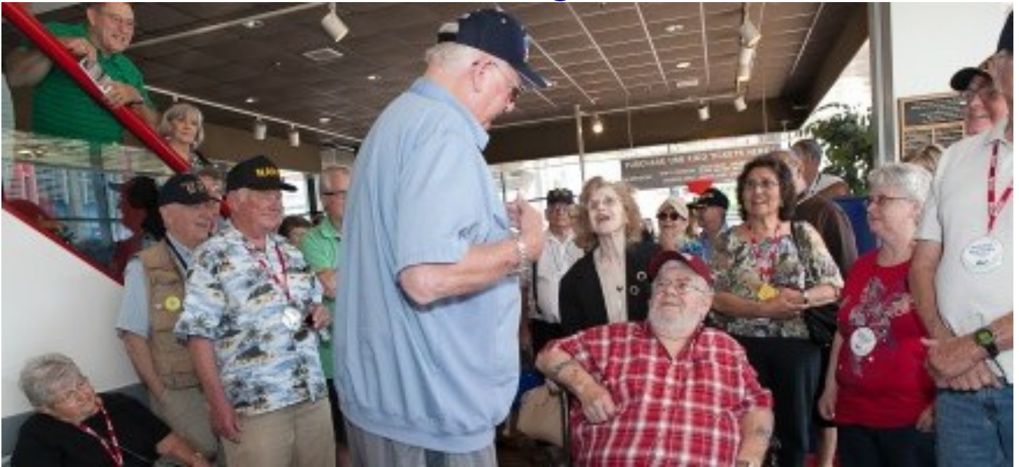
The Kidd's 'captain' tells tales of DD 661.