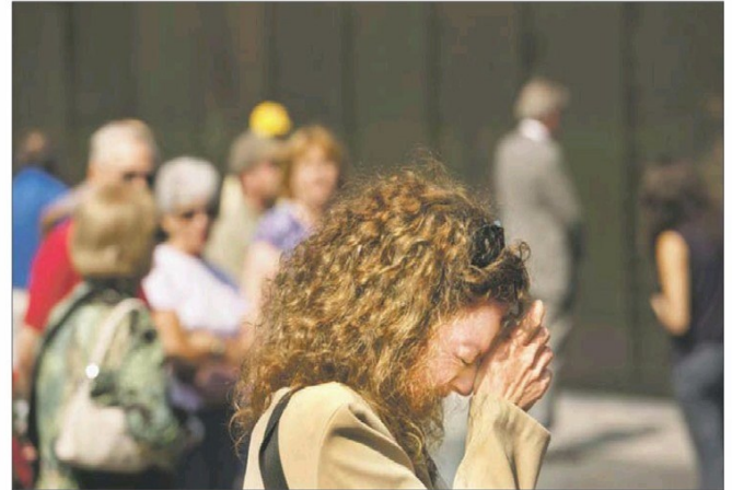
New names on the Wall